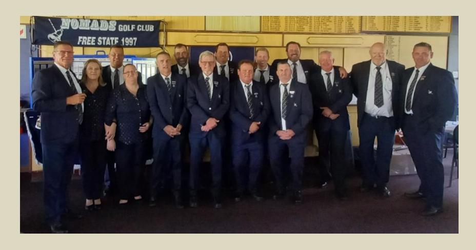
Free State Committee: 2022/2023